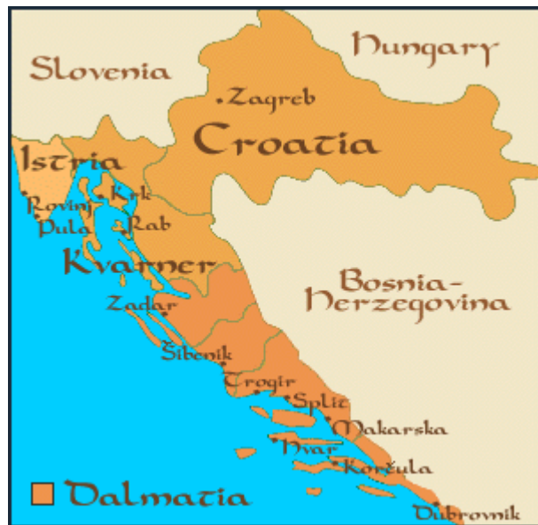
A modern map of Dalmatia